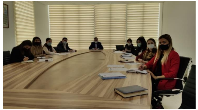
Online Kick off meeting, 4 November 2020